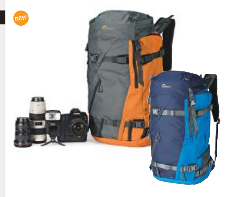
Photo: Powder BP 500 AW Location: Mont Blanc, Italy